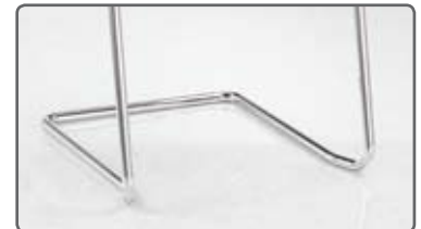
Optional stacking frame (G4 and G6)