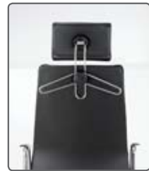
Optional headrest and coat hanger