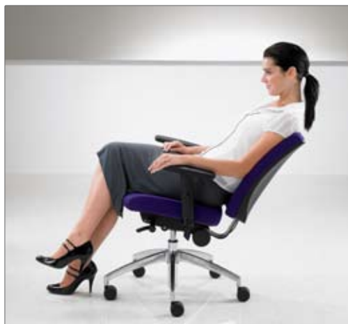
Maximum recline with M6 premium synchro mechanism