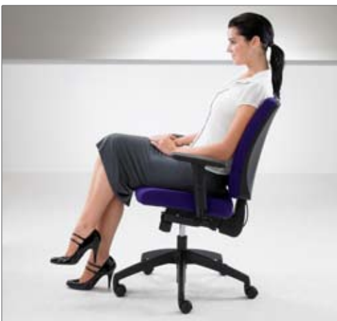
Maximum recline with M2 synchro mechanism