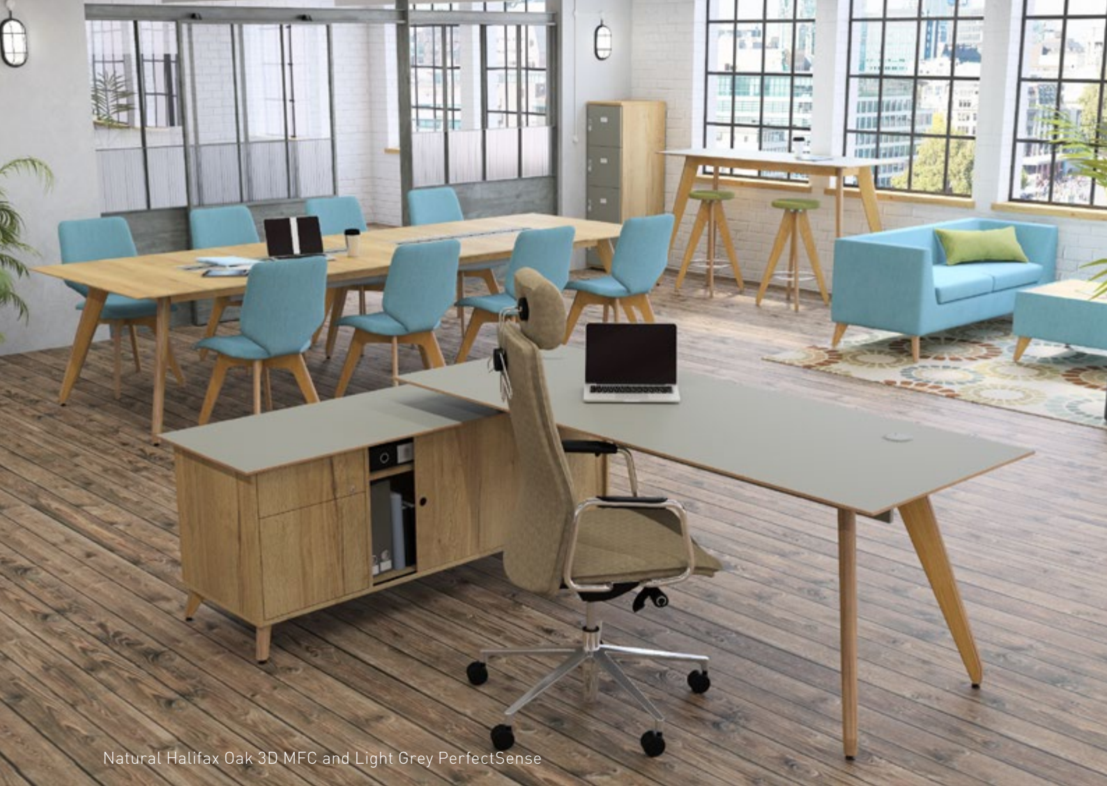
Natural Halifax Oak 3D MFC and Light Grey PerfectSense