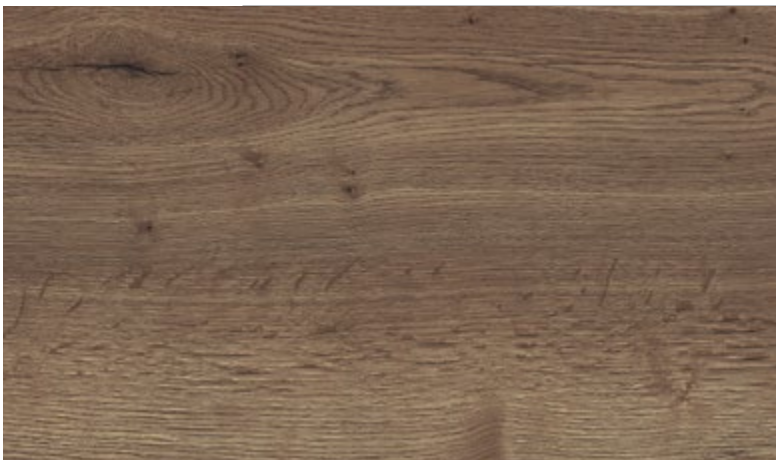
Tobacco Halifax Oak 3D