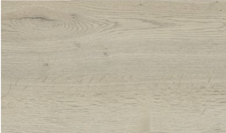
White Halifax Oak 3D