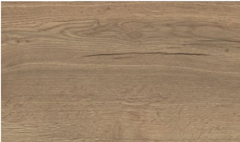
Natural Halifax Oak 3D