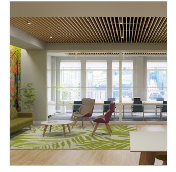
LIGNI SHOWN HERE FOR SOCIAL DISTANCING

The extensive use of birch ply in Ligni not only creates distinctive and immensely strong furniture, but also makes Ligni an environmentally friendly choice, as our sustainably sourced birch ply has full FSC chain of custody.